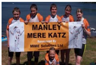
Trish's T15 windsurfing students at a junior race competition, sponsored by MIME Solutions.