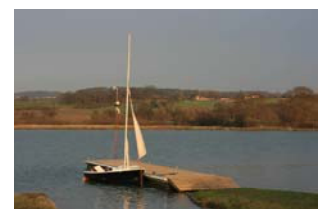
Manley Mere, one of MIME's off-site event venues, set in the heart of the picturesque Cheshire countryside.

“The whole group are taking more responsibility and the performance of the team has improved considerably” ... MIME’s approach (is) an effective method to engage individuals and motivate them to design and own sustainable solutions.”